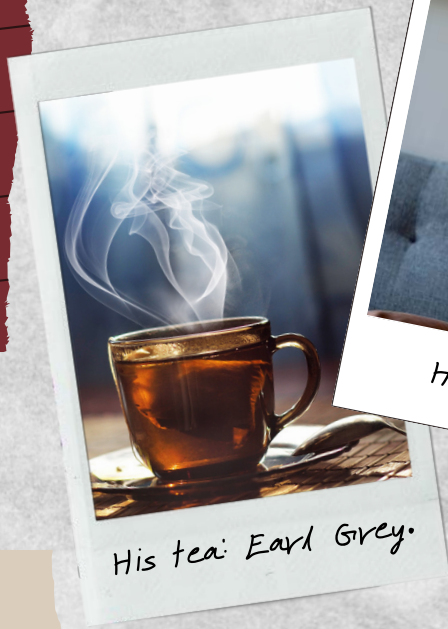
His tea: Earl Grey.